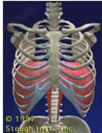
The diaphragm in maximum exhalation

breathed. Stough observed that this natural way of breathing was completely impossible in the emphysema patients. Their weakened diaphragms forced them to use their upper chest muscles and their shoulders to breathe, causing them to grab and gasp for air in a struggle to stay alive. The